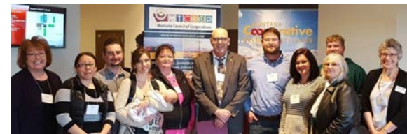
Basics Cooperative Summit regional attendees gathered for a photo opportunity