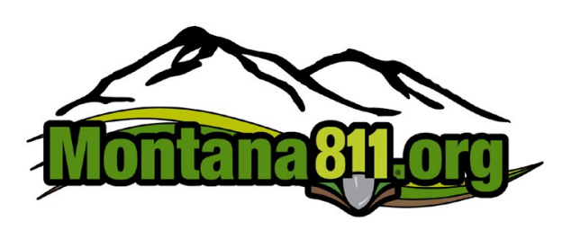
Know what's below. Call before you dig.